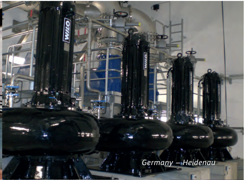
Germany – Heidenau