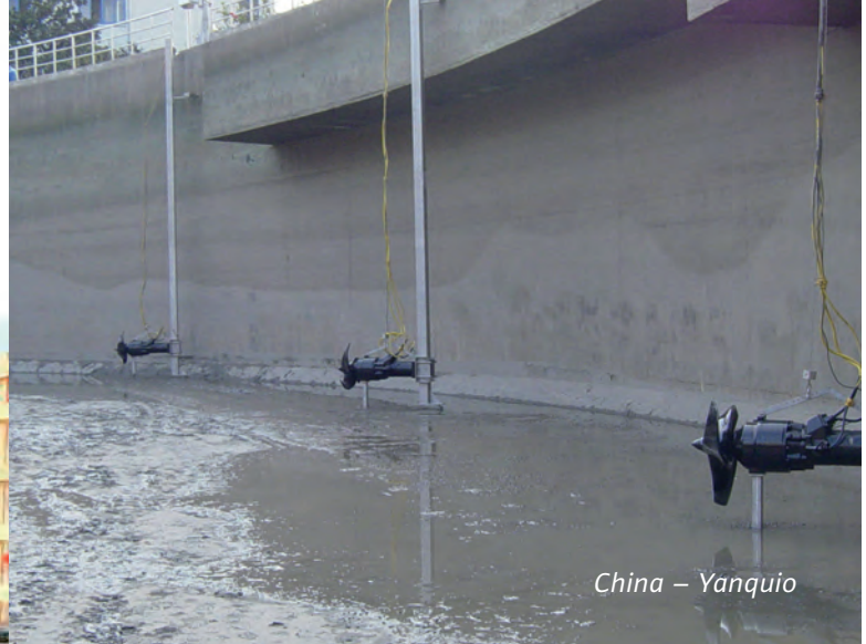
China – Yanquiao