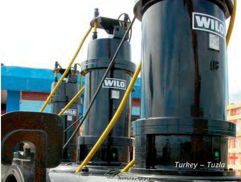
Turkey – Tuzla