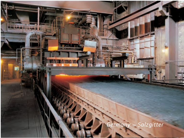
Germany – Salzgitter