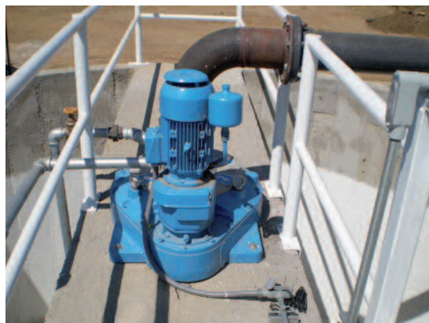
Reliable bull gear drive for the stirrer