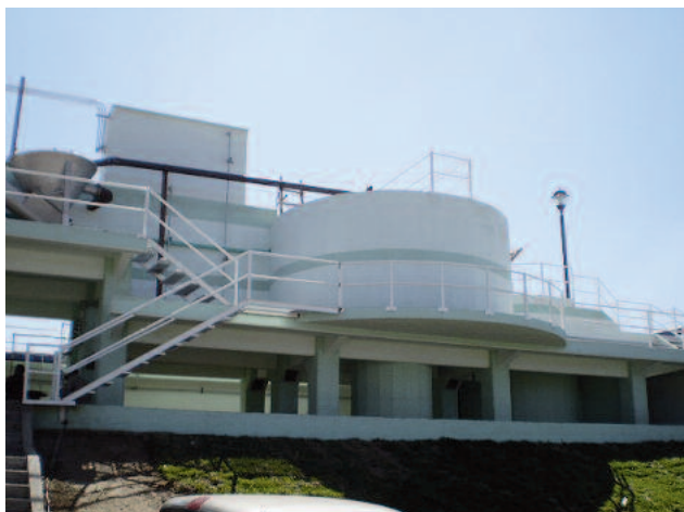
HUBER Vortex Grit Chamber VORMAX installation with Grit Classifier RoSF 3